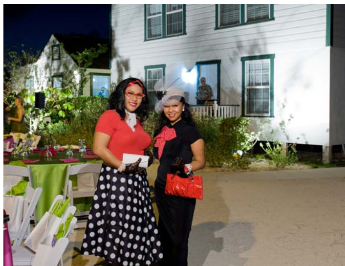
Top and Bottom: Winners of the traditional christmas tree contest from the Lighthouse School December 2010 and attendees at the 1950's event at the Mission House March 2011.