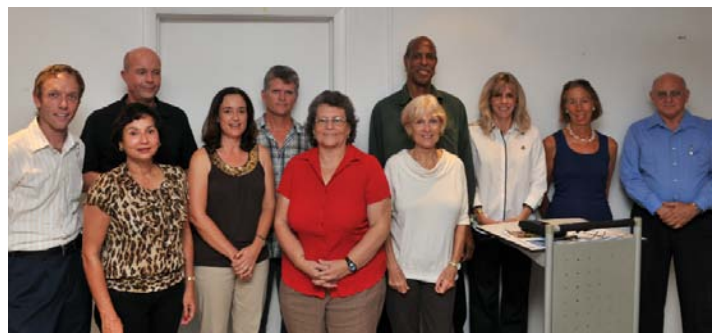
Trust Council at the 2010 Annual General Meeting.