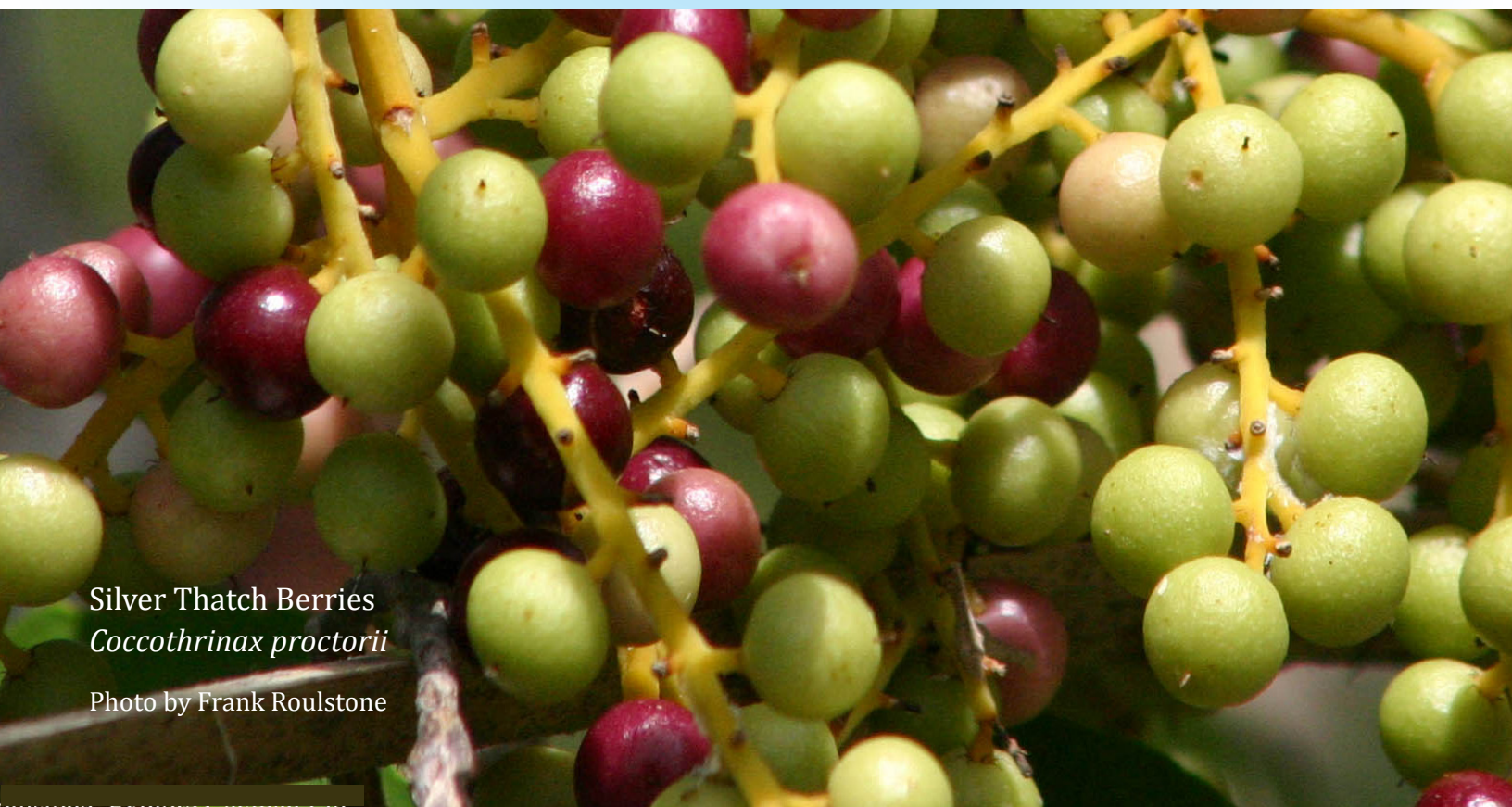
Silver Thatch Berries Coccothrinax proctorii

“To preserve natural environments and places of historic significance in the Cayman Islands for present and future generations.”