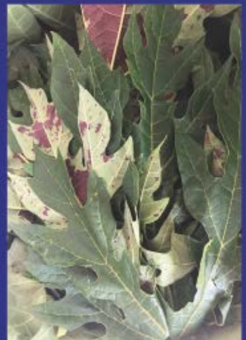
PAPAYA LEAVES AND FRUITS