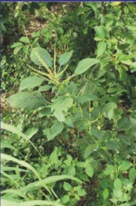
WILD CALLALOO LEAVES