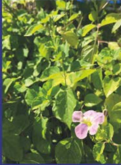
GANGES ROSE/ CHINESE VIOLET LEAVES AND FLOWERS