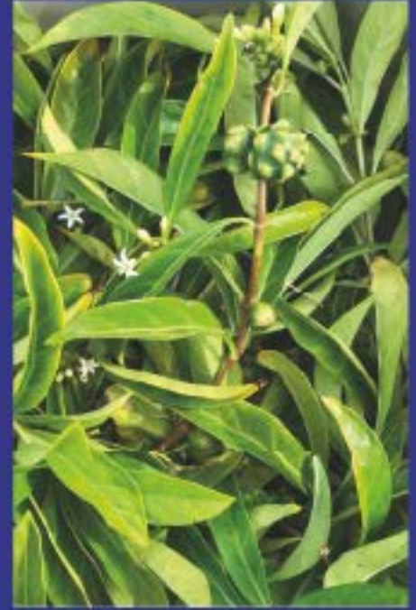
YELLOW ROOT LEAVES AND FRUITS