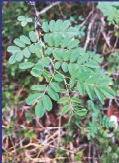
INDIGO LEAVES AND FLOWERS