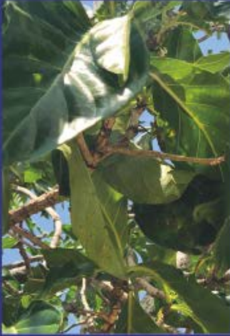
INDIAN MULBERRY (NONI) LEAVES AND FRUITS

Did you know, blue iguanas are known to eat over 105 different plant species? Many of the plants can be found alongside roadside verges and on private land. Here are some examples of the blue iguana's most staple food items: